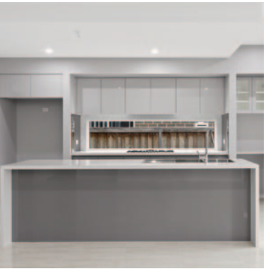
Smeg Built-in Rangehood