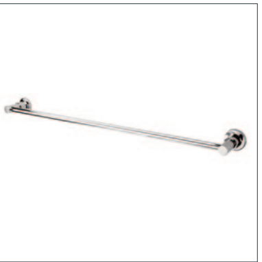
Phoenix Genx Bathroom Accessories