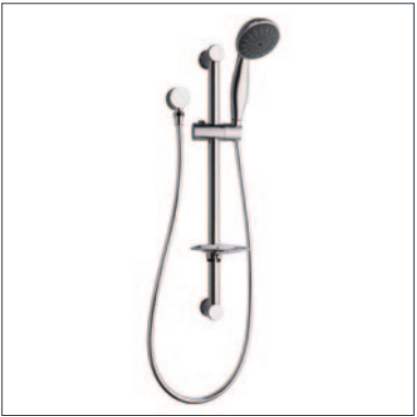
Posh Bristol Shower Rail