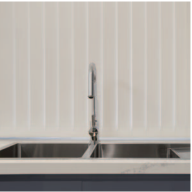
Double Bowl Sink with Drainers