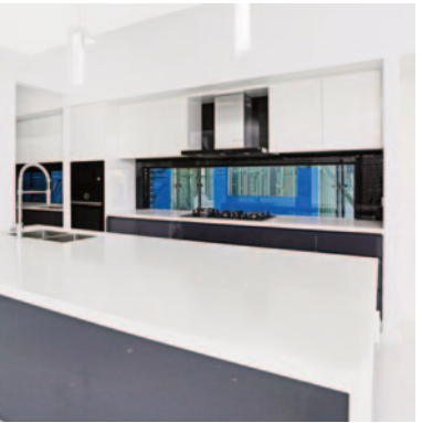
Feature Kitchen Splashback Window