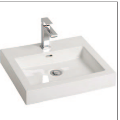
Semi Insert Basins