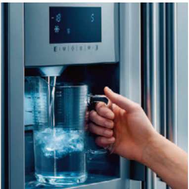
Cold Water Point To Fridge