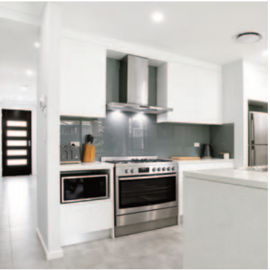
Daikin Fully Ducted Air-Conditioning