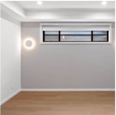
Taubmans 3 Coat Paint System