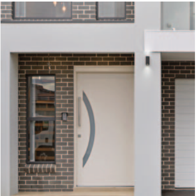
1200 Entry Door