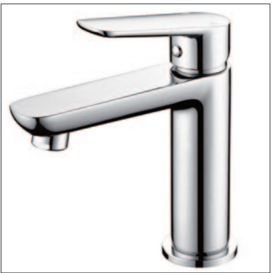
Mizu Bliss Mixer