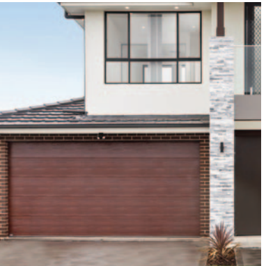
Timber Look Garage Door