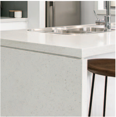
40mm Stone Bench with Waterfall