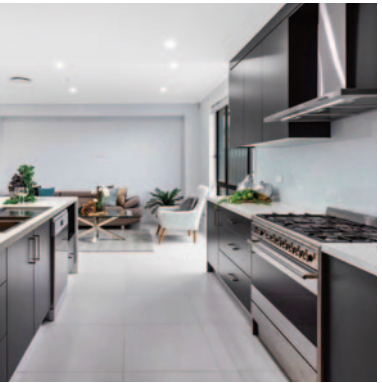
Smeg Freestanding Cooktop & Oven