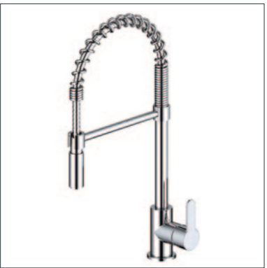
Mizu Soothe Sink Mixer