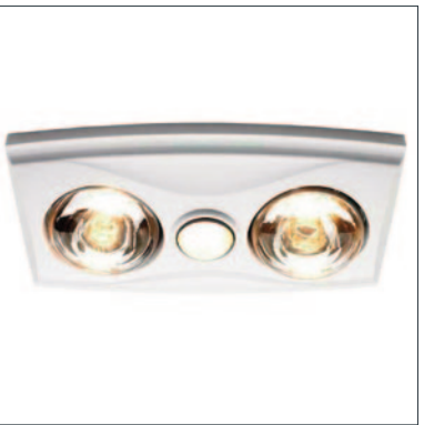
Heat Fan Lights to Ensuite & Bathroom