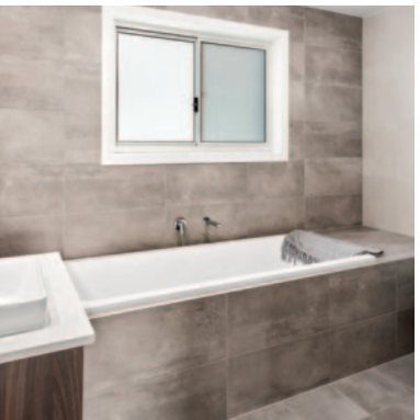
Insert Bath Tub