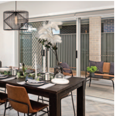
Aluminium Stacker Door