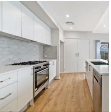
Soft Close Kitchen Doors with 2 sets of Pot Drawers