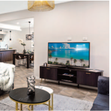
2x TV and 2x Data Points