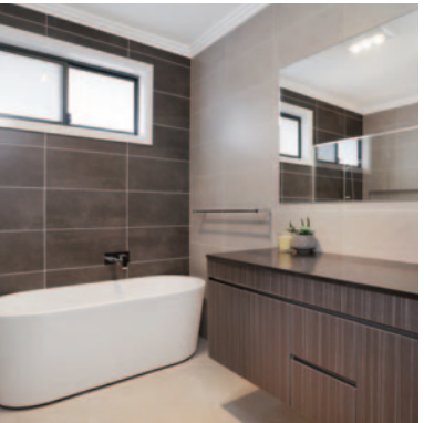
Full Height Tiling in Ensuite and bathroom