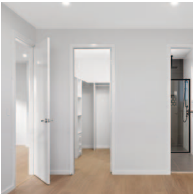
2700 GF with 2100 Internal Doors